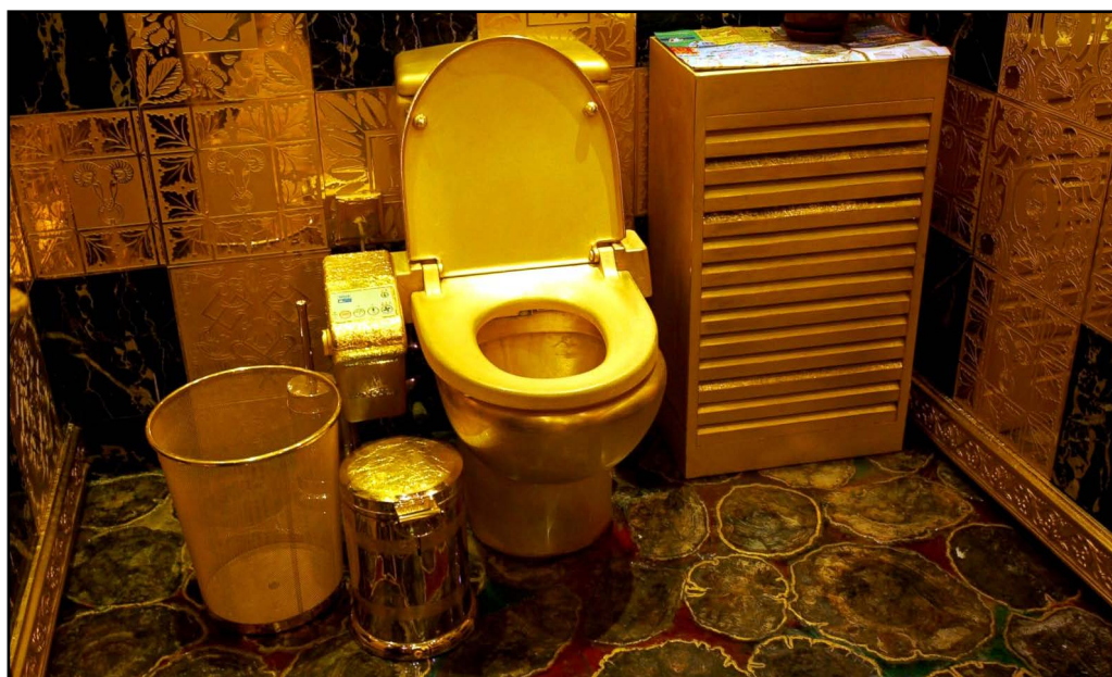
Photo of new Charney Hall Restroom. Each scholarship taken from a student can provide for a multi-use gender neutral gold toilet

2. Second floor ladies restroom: The only reason this scored above the pink restroom is purely for