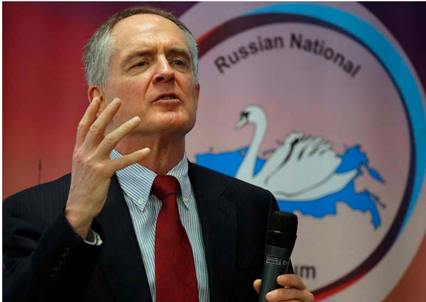
^ Jared Taylor

A worldly scholar and white nationalist, Jared Taylor was born in 1951 to missionaries working in Japan and educated at Yale and the Institut d'Etudes Politiques de Paris. Fluent in Japanese and French, he began developing a scholarly excuse for racism in 1990 when he founded the New Century Foundation, a think tank that promotes “research” arguing for white superiority.