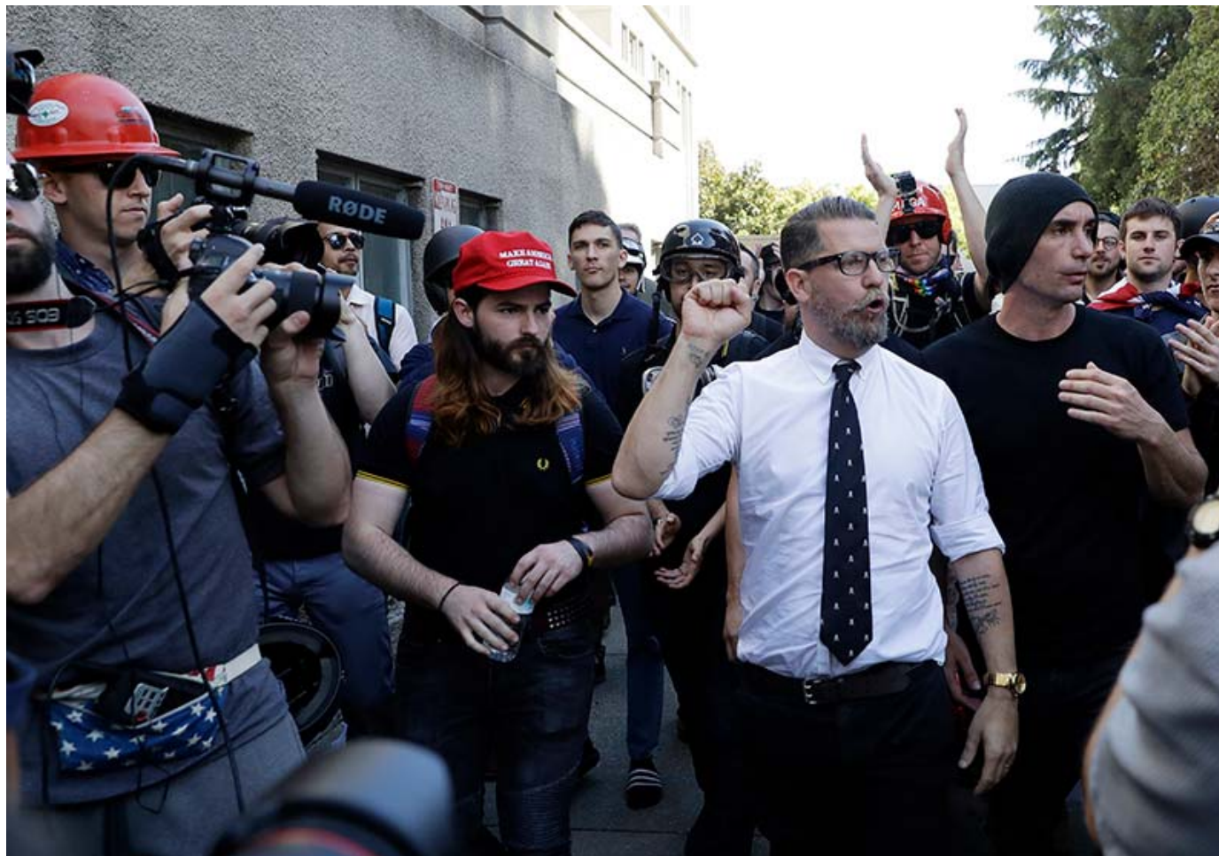
^ Gavin McInnes

For Gavin McInnes, the Proud Boys organization he founded is a “pro-West fraternal organization.” Others, however, describe it as the military arm of the alt-right, eager to clash with anti-fascist protesters. Although there initially aren’t any overtly racist themes, it sounds quite similar to a neo-Nazi “fight club” called the “DIY Division.”