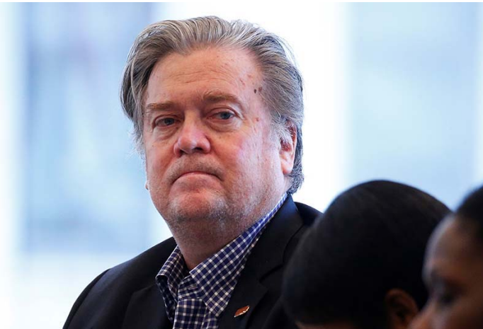
^ Stephen Bannon

Four days after the inauguration, white nationalist leader Richard Spencer told a TV interviewer, “Trump is a white nationalist, so to speak. He is alt-right whether he likes it or not.”