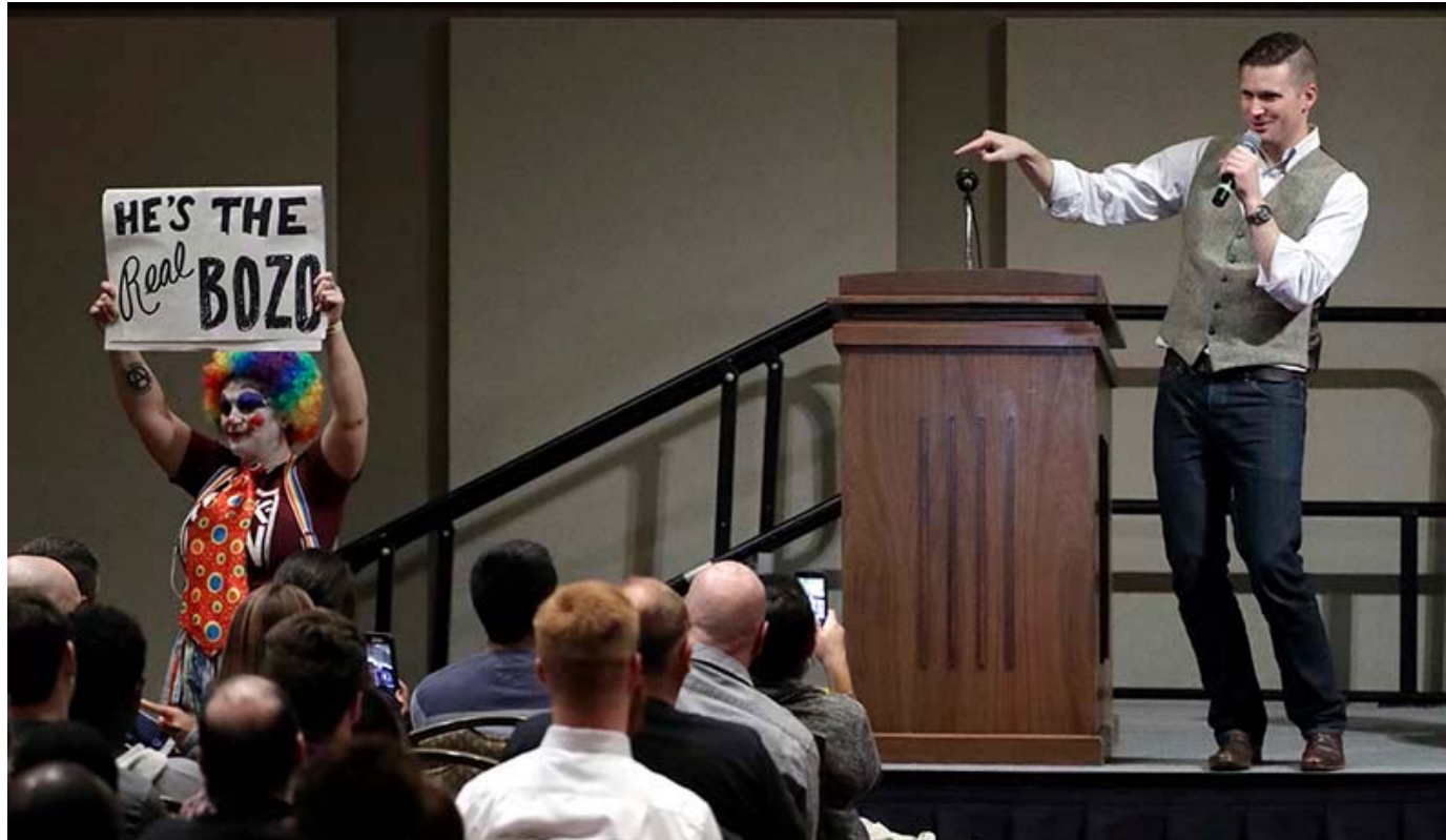
^ Richard Spencer

Born in 1978 and raised in Texas, Richard Bertrand Spencer has become one of the country's most successful young white nationalist leaders. He's also credited with coining the term "alt-right" in 2008.