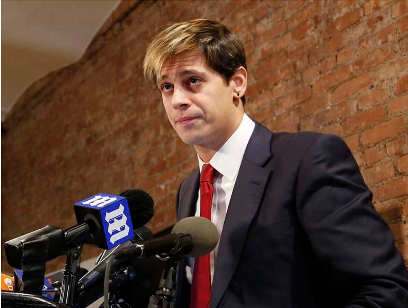
^ Milo Yiannopoulos

The most flamboyant alt-right speaker, British citizen Milo Yiannopoulos was born Milo Hanrahan in 1984 to a Greek father and British mother. A deliberately offensive provocateur who calls himself the “Dangerous Faggot,” he has spoken at dozens of colleges.