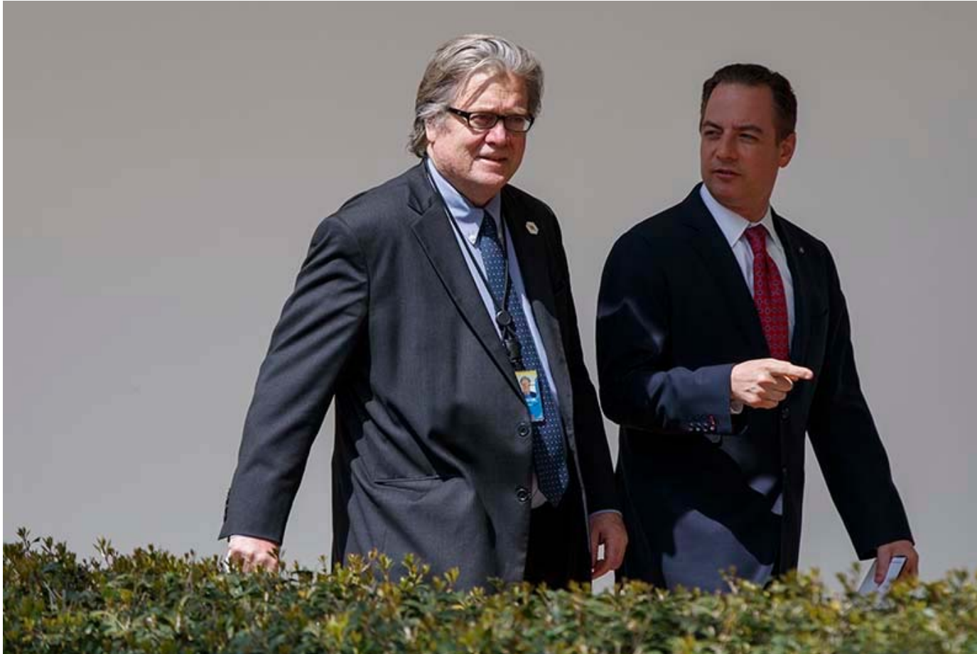
^ Stephen Bannon (left) with Reince Priebus, Former White House Chief Of Staff

Before he became the chief strategist for Donald Trump, Stephen Bannon, 63, was the chief enabler of the alt-right movement. Without Bannon's ascension to the Oval Office, the movement would likely still be confined to the dark corners of the internet. Born to a working class family in Norfolk, Virginia, Bannon joined the Navy and worked his way up to a Pentagon job.