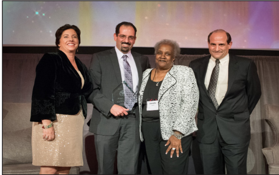
Celebration of Achievement Awards Ceremony.

The prior year’s honorees shared their awards by introducing this year’s stars. A brief video accompanied each introduction, showing the honoree and his or her friends and colleagues. As each of the five honorees ascended the stage to accept his or her award, we in the audience