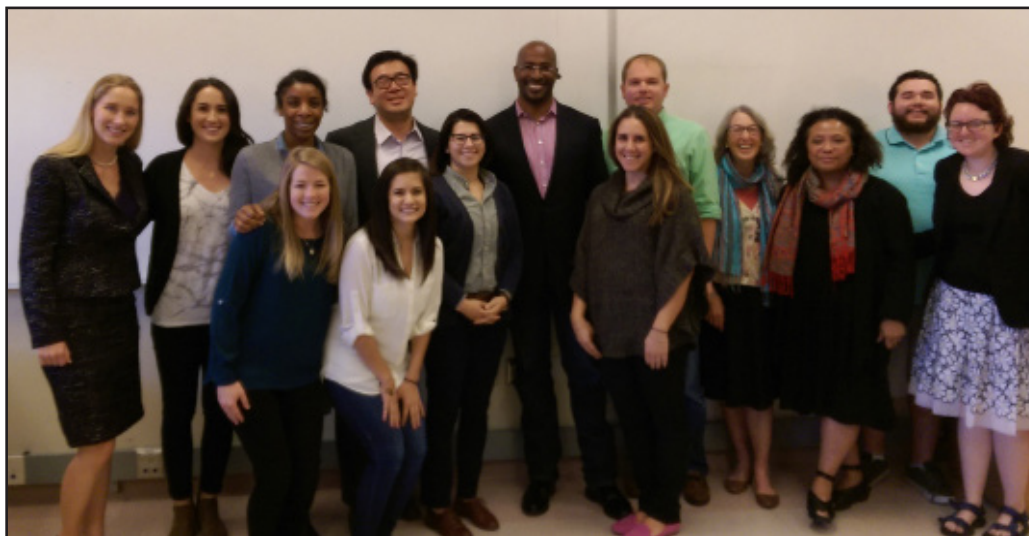
Students meet with Van Jones.

Jones kept with the underlying message of #cut50 during his hour-long discussion at Santa Clara. Jones framed mass incarceration as a