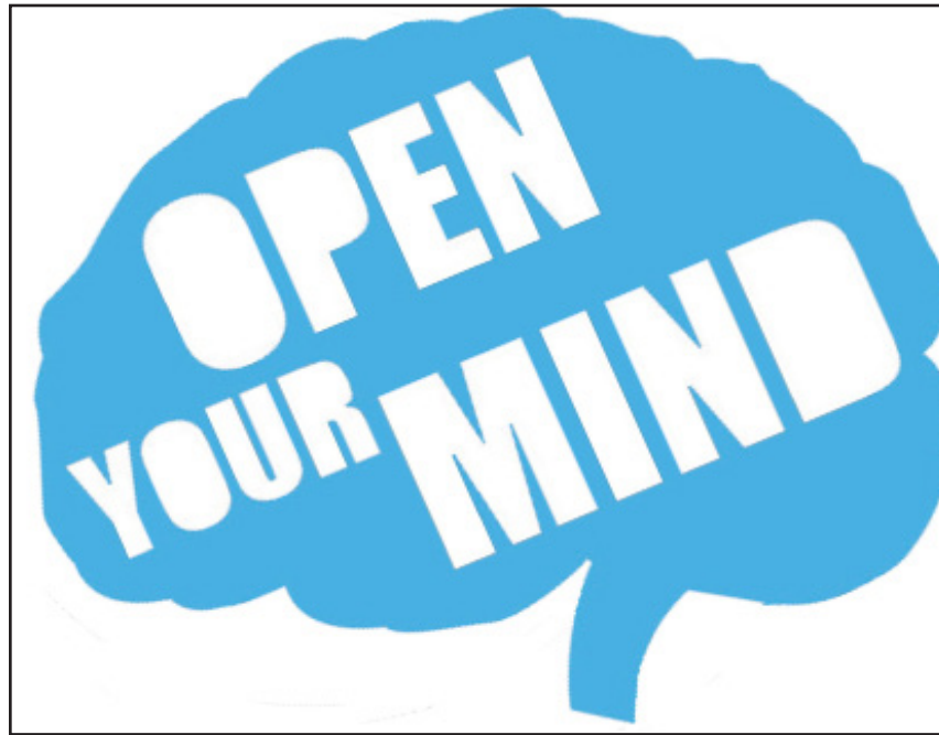
figure out ways to care for each other. That doesn't mean that students should bear the responsibility, as they too often do now, for taking care of each other in crisis. Students have enough on their plate already. It means that we create a culture in which people feel okay asking for help, acknowledging their difficulties, and showing weaknesses.

Doubtless people already feel like they need help, have difficulties, and have weaknesses. I just want to make sure that we can talk about this stuff without people feeling stigmatized. If we can, then we have a shot at helping more folks deal with the issues they're facing."