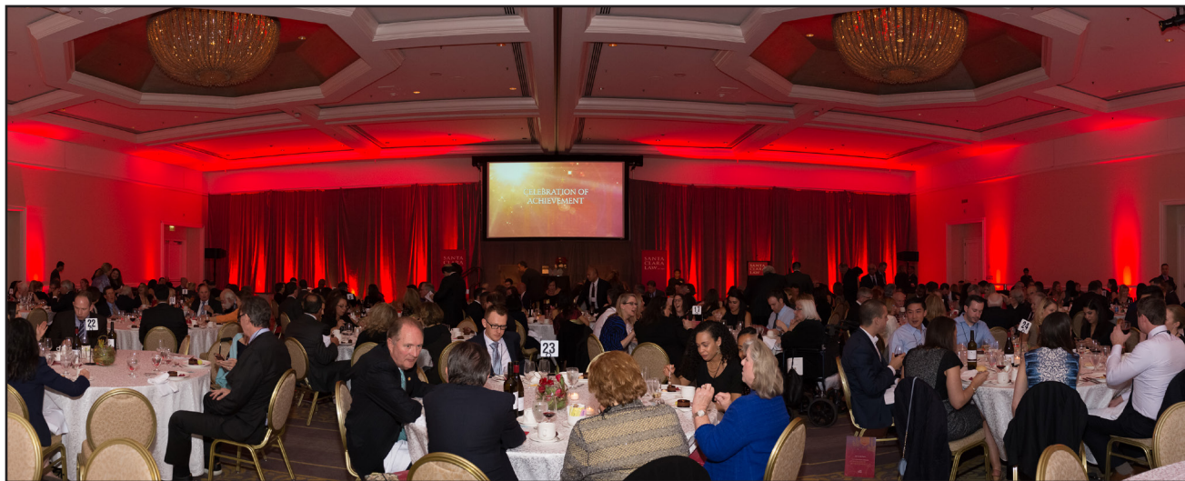
Santa Clara Law community feasts at the Celebration of Achievement.

videos, please visit http://law.scu.edu/event/2016-celebration-of-achievement/ . Sponsors for the event are also listed, including Wilson Sonsini Goodrich & Rosati, Hopkins & Carley, Morrison Foerster, Womble Carlyle, McCurdy & Fuller, Adleson Hess & Kelly, and more.