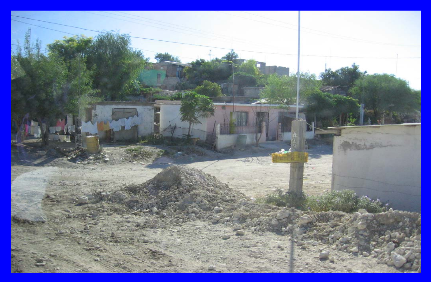
A street in Acuna