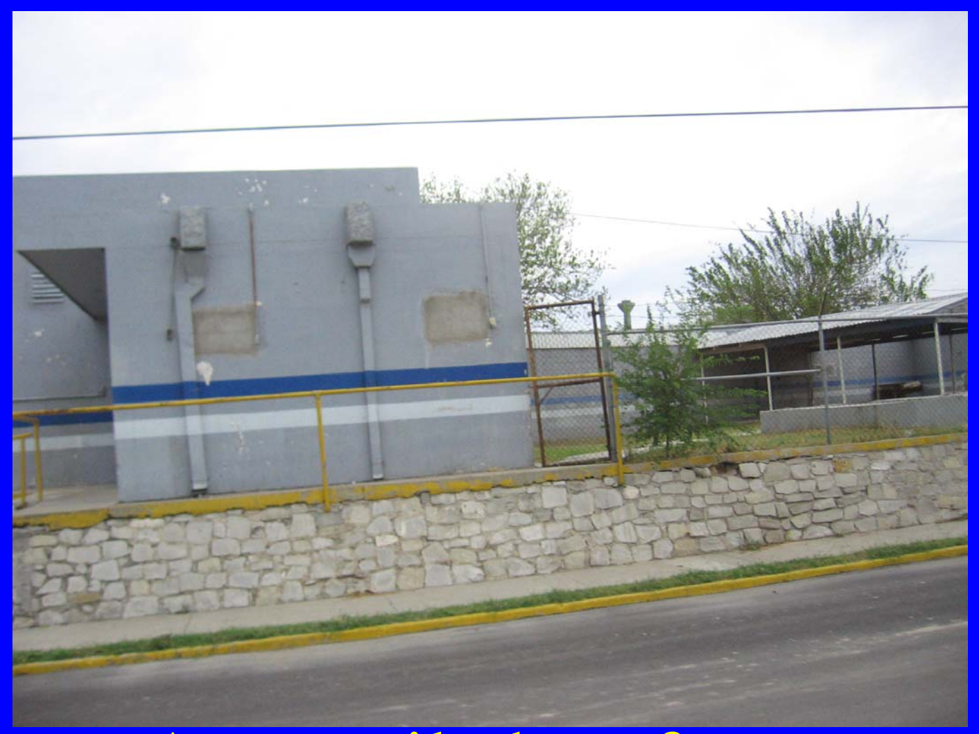
A maquiladora factory