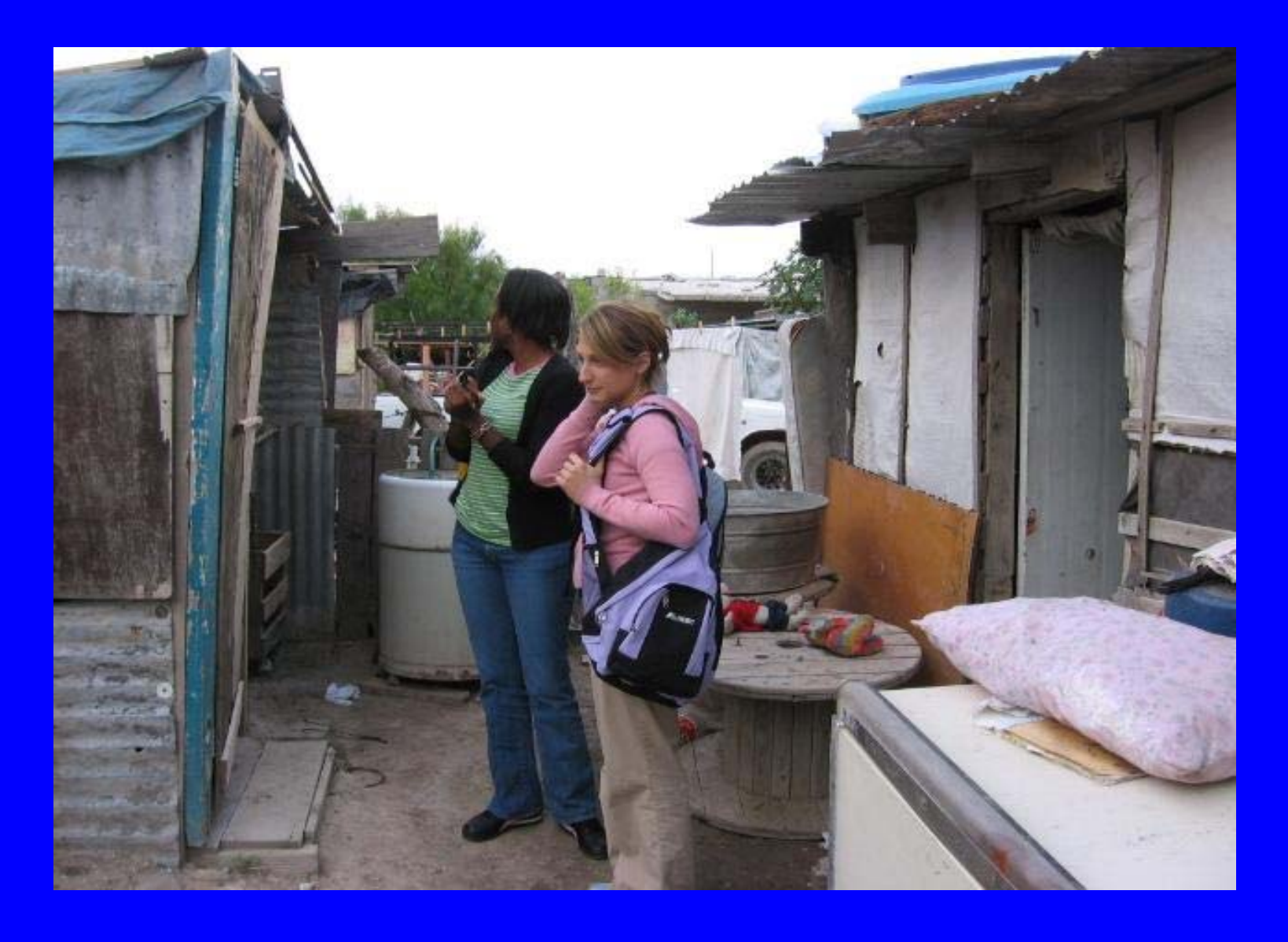
The bathroom at Lety's