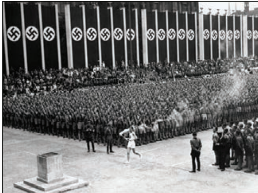
The IOC has always strove to keep the Olympics away from political controversies, with limited success

If the IOC can be so vigilant in protecting its own image from events that occur during the Games, it can surely be just as proactive in preventing that harm through the selection of proper hosts at the very least. While the IOC's latest mission has been to see that the Games move beyond the comfortable borders of Europe and North America - into locales and even continents that have yet to host an Olympics, they cannot ignore the fact that awarding the Games to the capital city of a despot gives tacit if not outright approval to that despot's government. The IOC is not merely an apolitical sports authority, but an international organization that can – and must – use its power to advance human rights.