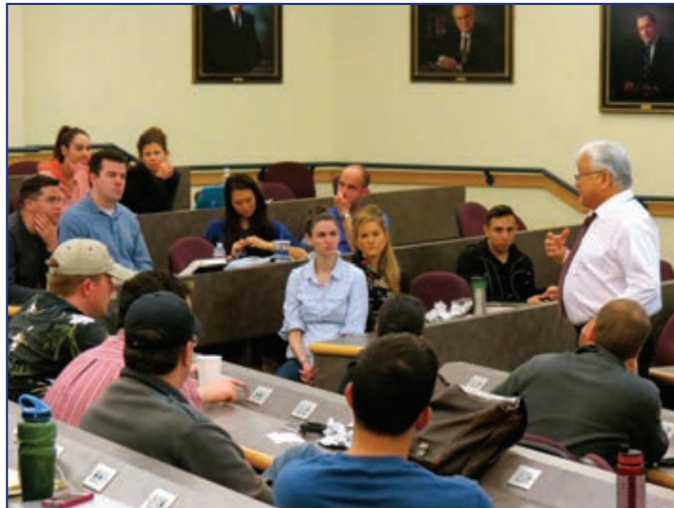
Congressman Mike Honda discusses immigration reform with SCU Law Students.

Following pleasantries, Congressman Honda set forth his agenda by noting that the "immigration system is a legalized system of discrimination". Honda quickly pointed out that immigration reform, with respect to