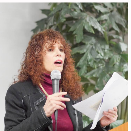
RUTH SILVER TAUBE KATHARINE & GEORGE ALEXANDER COMMUNITY LAW CENTER

Information and the overview provided is an educational service only and is not a substitute for seeking qualified professionals for legal advice on particular matters.