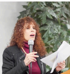
RUTH SILVER TAUBE KATHARINE & GEORGE ALEXANDER COMMUNITY LAW CENTER

Information and the overview provided is an educational service only and is not a substitute for seeking qualified professionals for legal advice on particular matters.