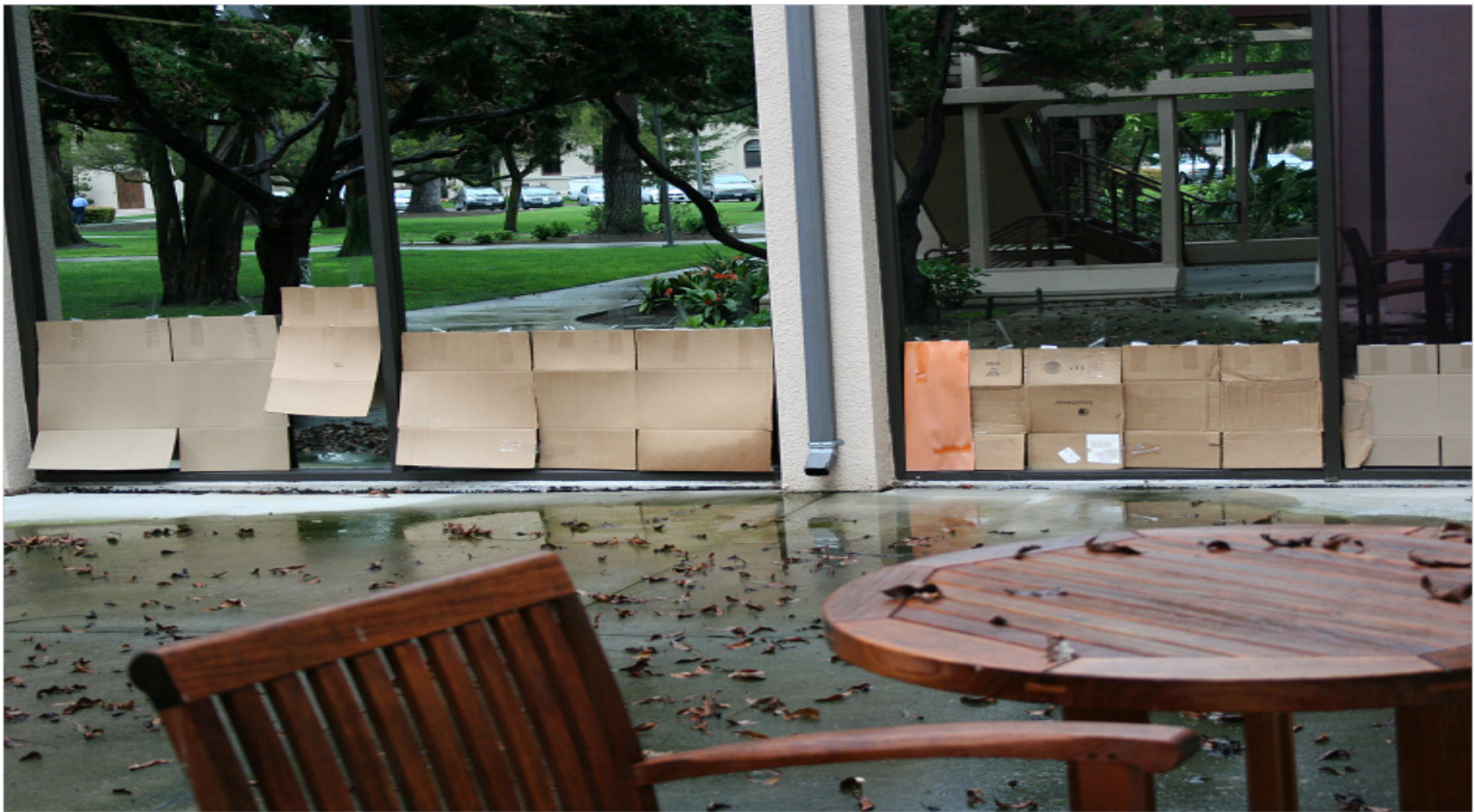
Pictured Above: Both corrugated and non-corrugated flattened cardboard boxes work tirelessly to prevent the structural collapse of Heafey Law Library. For more on future Heafey improvements, see page 3.