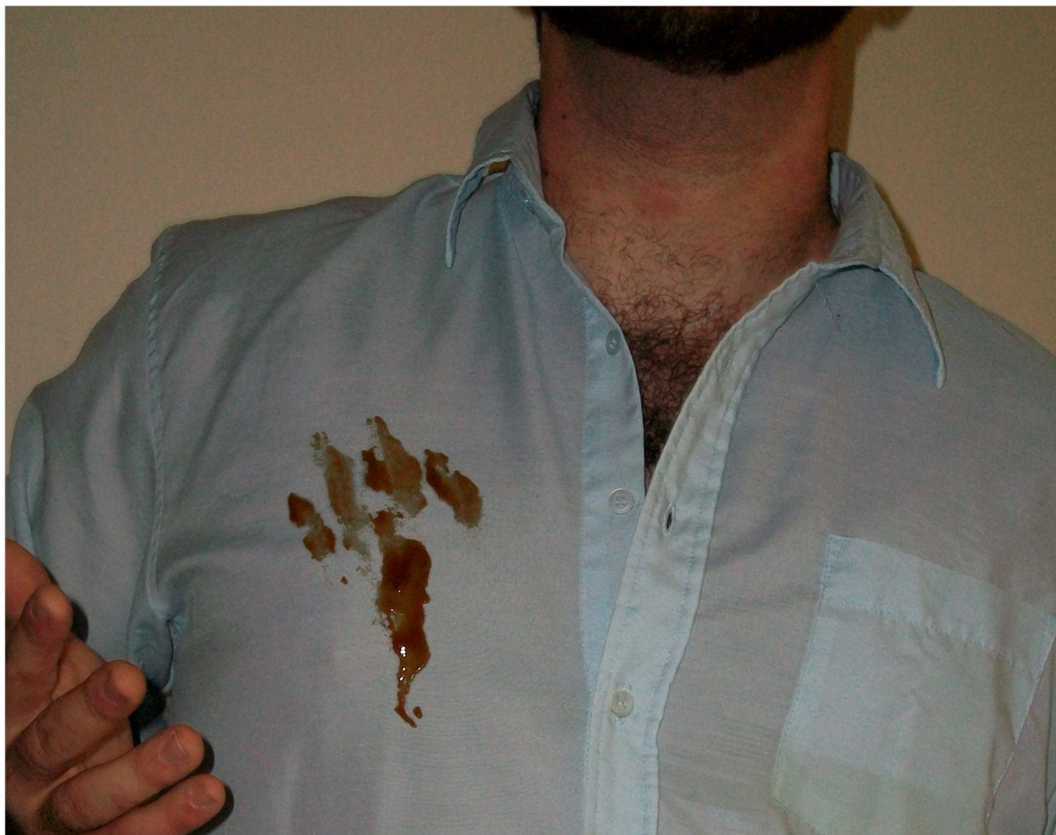
Pictured Above: Area Santa Clara Law Professor forges on through his California Civil Procedure lecture despite a suspicious-looking stain on his upper right breast. Professor ignored various student attempts to call attention to the fist-sized slop stain.